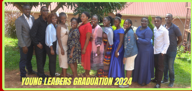
YOUNG LEADERS GRADUATION 2024