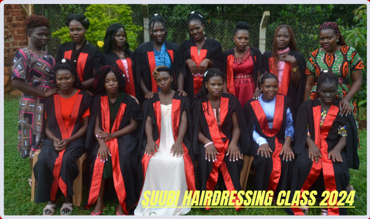
SUUBI HAIRDRESSING CLASS 2024