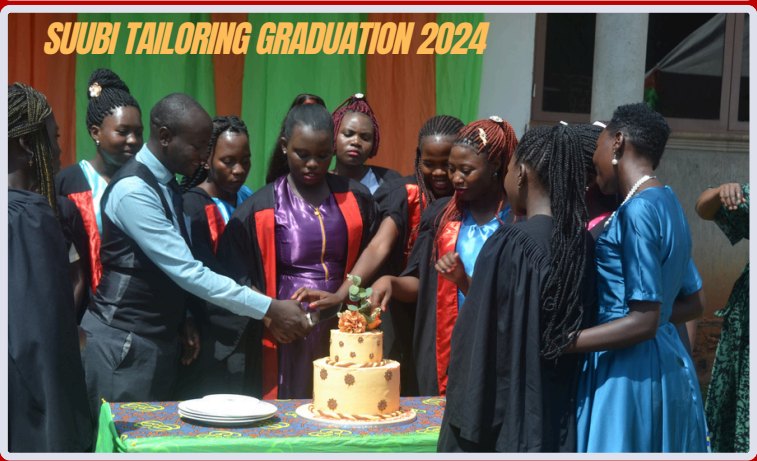
SUUBI TAILORING GRADUATION 2024