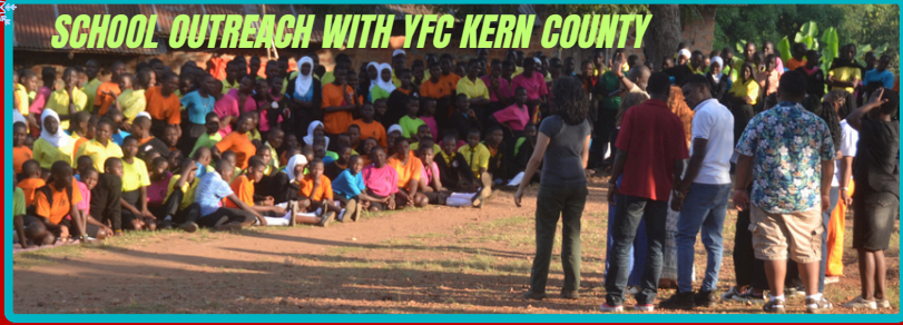
SCHOOL OUTREACH WITH YFC KERN COUNTY