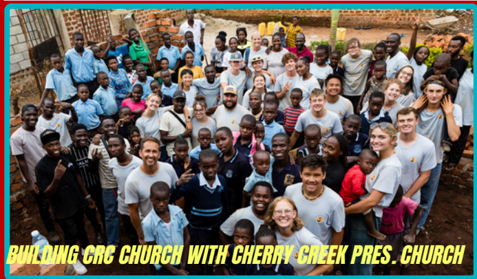
BUILDING CRC CHURCH WITH CHERRY CREEK PRES. CHURCH