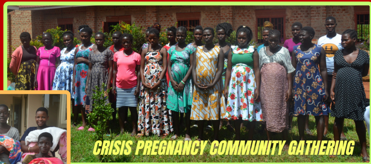
CRISIS PREGNANCY COMMUNITY GATHERING