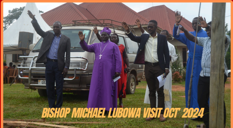
BISHOP MICHAEL LUBOWA VISIT OCT 2024